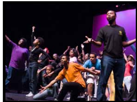
The Saturday cast performs their opening number.

DVDs of this production are available at: www.the-possibility-project.org/store